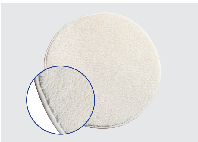
Tape binding of mats- and car carpets.